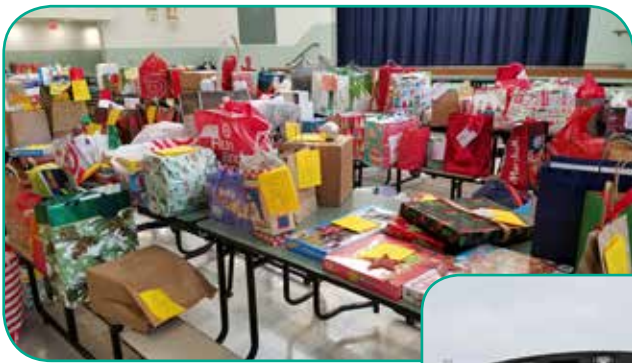
Gifts galore donated by parishioners.