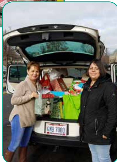
Hispanic Senior Center pickup.